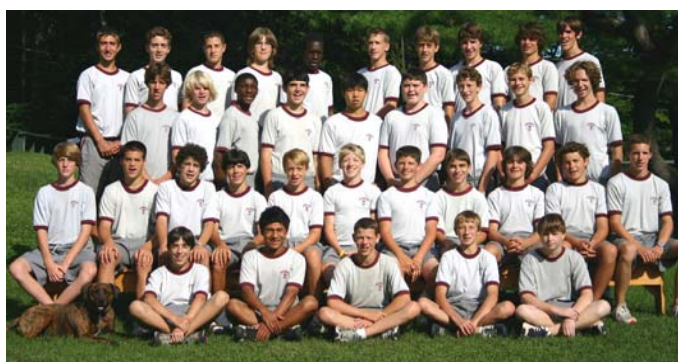
2005 Upper Campus