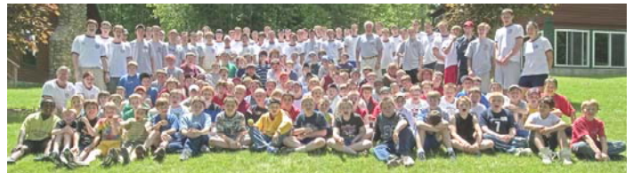
On February 22, 2005, The Main Idea at Camp Agawam was awarded the Eleanor P. Eells Award for Program Excellence by the American Camping Foundation at their National Conference in Orlando, Florida.