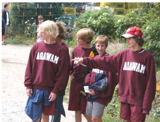
Senior Boys on the Post Camp Trip Explore Monhegan Island