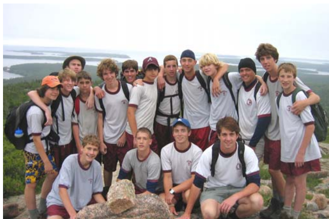
15-year-olds in Acadia National Park

One of the biggest strengths at Agawam is the quality of the campers, and nowhere is that more apparent than in this year's 15-year-old class. The 14 senior campers provided valuable and inspired leadership throughout the summer, from Ag v. Wam competitions to inter-camp matches where Agawam continually showed great effort and sportsmanship. The 15-year-old summer is filled with responsibilities from covering cabin clean up on Saturdays when counselors are in Katiaki meetings, to setting the tone in Upper Campus for the rest of Camp to follow. Camp is only as strong as its 15-year-old class. From the Indian Peace Pipe Ceremony to completing the work on their Woodcrafters, their summer is filled to the brim with activity and goals and, most importantly, fun. One of the reasons this year's 15-year-old class was so successful was that they know Camp well. Together they have spent 85 summers at Agawam, averaging 6.1 summers each. Paying respect to that were the many counselors who wrote and read tributes to each boy at the "Senior Tribute Ceremony," a touching ceremony where counselors let certain boys they are close to know just how much their friendship means to them. Seven boys in the 15-year-old class were awarded Trophies or Totem at the Closing Ceremonies, further evidence of the strength of this class. Although their final summer as campers has ended, a long term relationship with Agawam has really just begun. We hope to see all of them back in the coming years.