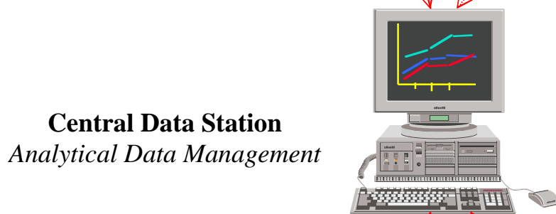
Central Data Station